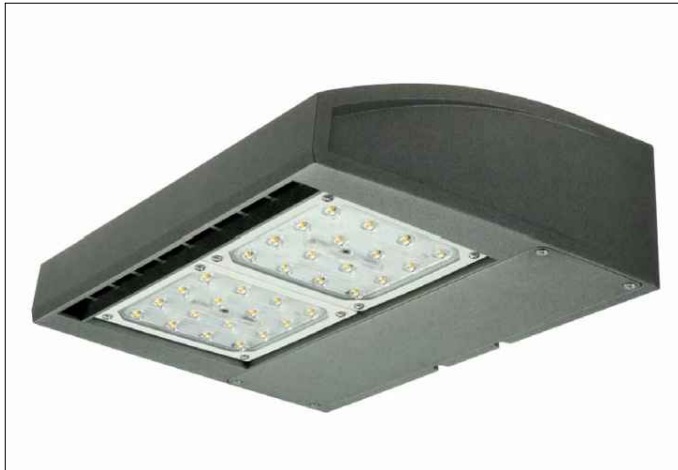
TYPE - SC, SG