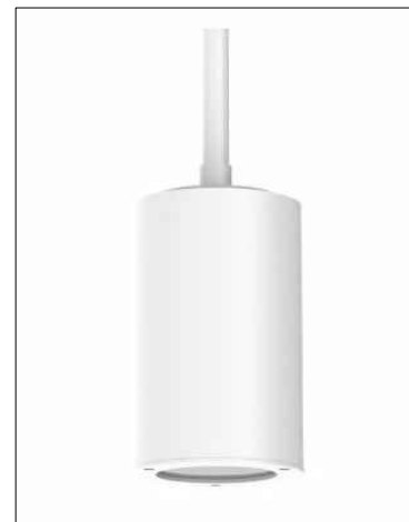
TYPE - SF