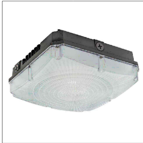
TYPE - SE