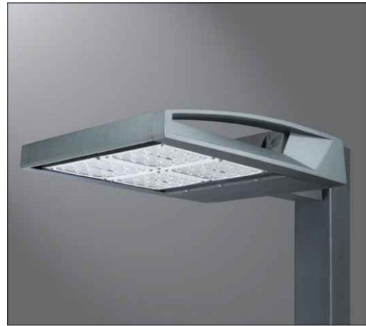
TYPE - SA, SB

IT IS A VIOLATION OF THE LAW FOR ANY PERSON, UNLESS ACTING UNDER THE DIRECTION OF A LICENSED ARCHITECT TO ALTER THESE PLANS AND SPECIFICATIONS. THIS DOCUMENT CONTAINS PROPERTY INFORMATION AND SHALL NOT BE REPRODUCED, OR ITS CONTENTS DISCLOSED, IN WHOLE OR IN PART, WITHOUT THE PRIOR WRITTEN CONSENT OF GALLO HERBERT ARCHITECTS. COPYRIGHT 2023 GALLO HERBERT ARCHITECTS